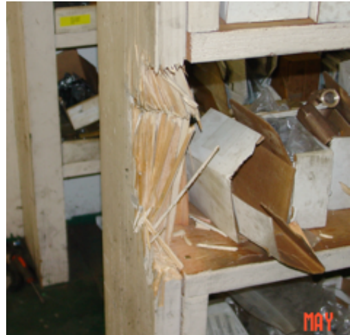
Shelf damaged by flying tools demonstrates violent nature of the event.

Based on the witness interviews, the accumulator had been strapped to a metal workbench. It is unknown if the side-located warning label was visible to the victim after the accumulator had been strapped to the bench. A steel plate adapter with a large nut welded to the center had been bolted onto the end cap (in red circle in