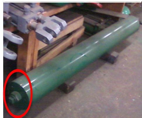
BELOW: Hydraulic accumulator (same model as in incident) with hydraulic pressure end cap shown in the red oval.