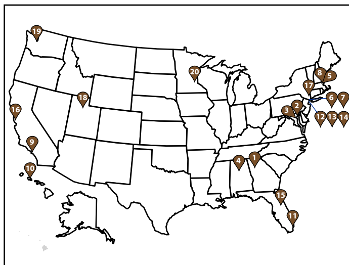
FIGURE 2. U.S. GeoSentinel sites* — GeoSentinel Network, 2012–2021

* Sites include Atlanta, GA (1); Baltimore, MD (2); Bethesda, MD (3); Birmingham, AL (4); Boston, MA (5); Bronx, NY (6); Bronx Lebanon, NY (7); Cambridge, MA (8); Hollywood, CA (9); Honolulu, HI (10); Miami, FL (11); New York City, NY (12); New York Northwest, NY (13); New York West, NY (14); Orlando, FL (15); Palo Alto, CA (16); Peekskill, NY (17); Salt Lake City, UT (18); Seattle, WA (19); and St. Paul, MN (20).