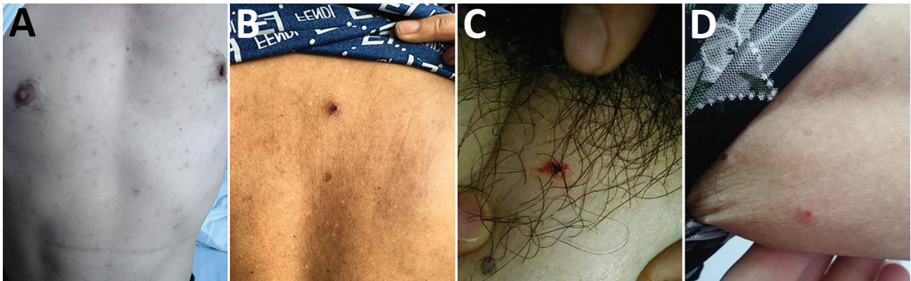
Figure 2. Lesions on patients with Rickettsia japonica infection, Xinyang, China, March 2014–June 2017. A) Rash on ventrum; B) rash and eschar on back; C) eschar on femoribus internus; D) tick bite site on left armpit.

Because of the appearance of typical rash, we suspected SFG rickettsioses in 10 patients and treated them with doxycycline (100 mg 2×/d) until their fevers dissipated and clinical disease improved (median 4 [range 3–5] days). The other 4 patients were treated with the antimicrobial drugs