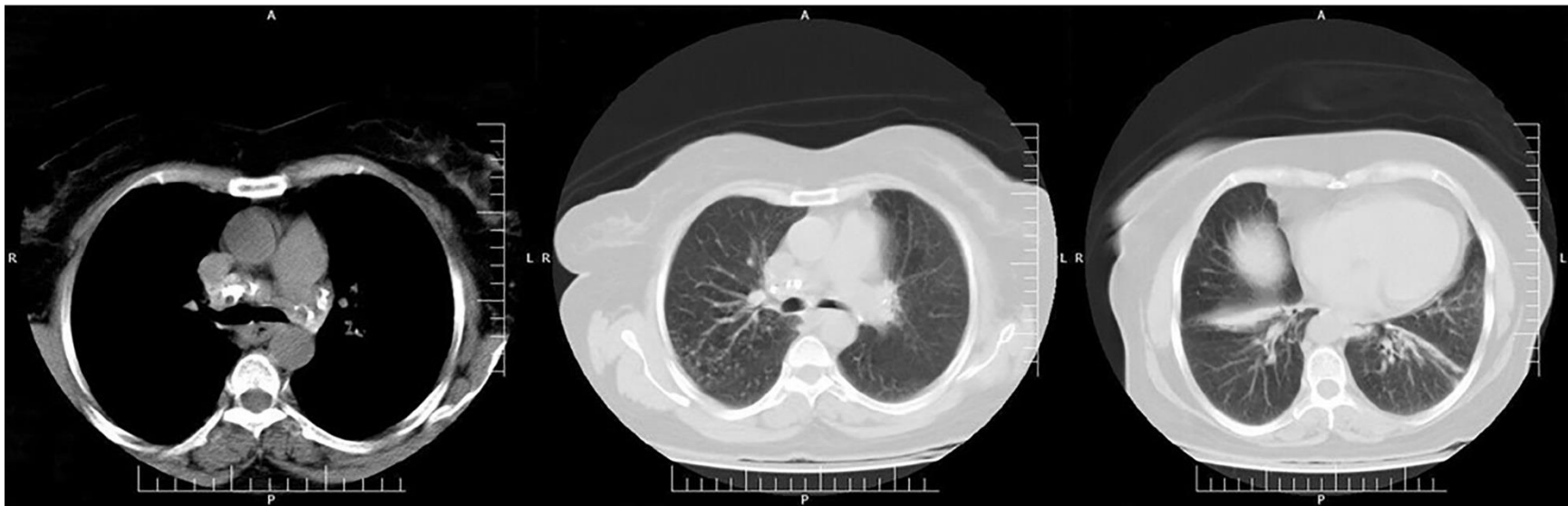
Figure: Chest CT scan image indicating calcified mediastinal lymph nodes, nodular opacities on both sides, a linear band in both lower lobes, partial wedge-shaped collapse in the right lower lobe, and fibrotic changes in the left lower lobe.