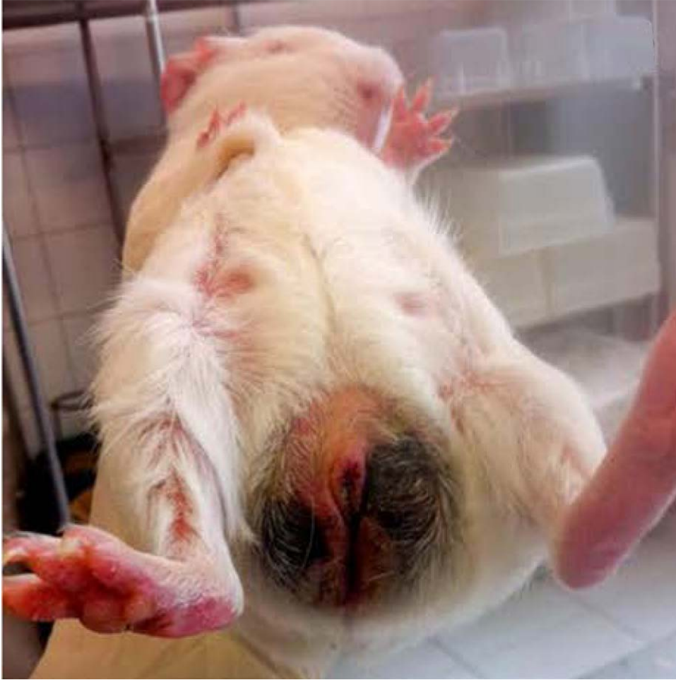
Technical Appendix Figure 2. Scrotal necrosis in a guinea pig that had been inoculated with Rickettsia rickettsii -infected Vero cells 14 days previously.