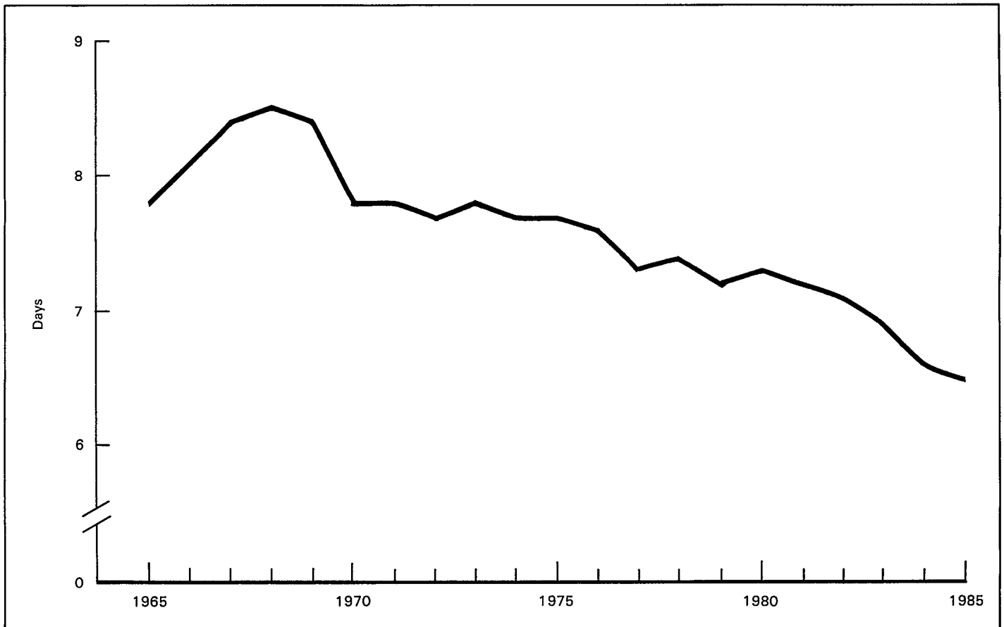
Figure 2. Average length of stay in non-Federal short-stay hospitals: United States, 1965-85

ing newborn infants, were discharged from short-stay non-Federal hospitals in the United States. These patients were hospitalized an average of 6.5 days and used 226.2 million days of inpatient hospital care. Patients hospitalized during 1985 accounted for 148 discharges per 1,000 civilian population.