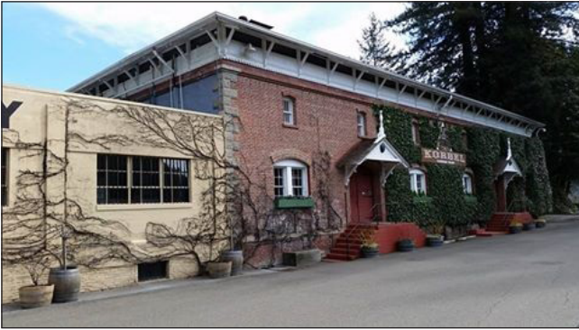
Korbel Champagne Cellars.