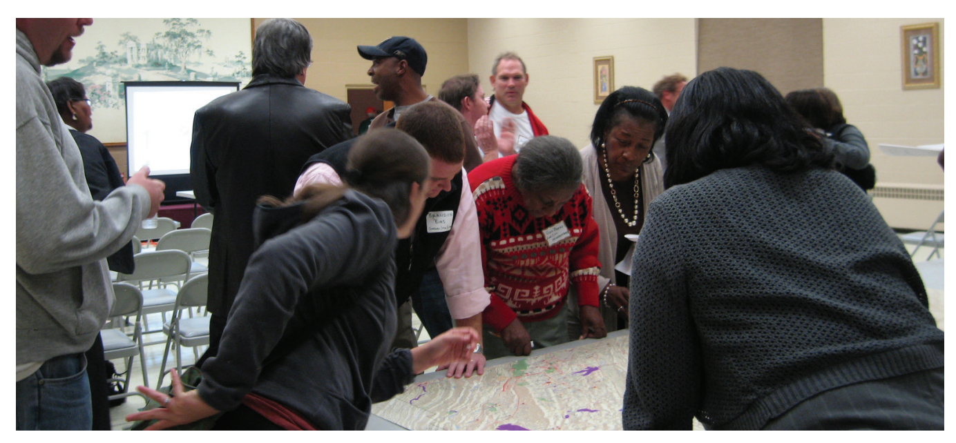
Community residents in Jefferson County, AL engage in development of the Red Rock Ridge and Valley Trail System Master Plan.