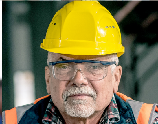
Photos courtesy of Getty Images. Photos depict general types of individuals who may be eligible for the World Trade Center Health Program and not actual members.