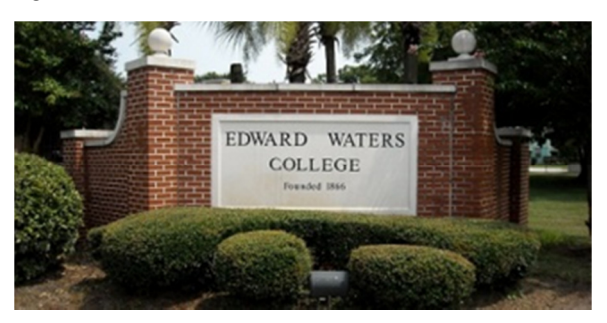
Edward Waters College in Jacksonville, Florida.

field and administrative skills to use in supporting the effort to develop new and better tools to address the TB epidemic through her work as a leader in DTBE's CRB.