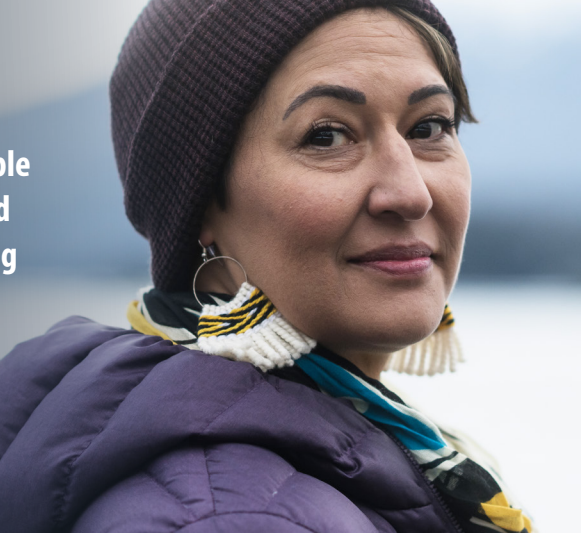
From 1999 to 2018, more than 232,000 people in the United States died from overdoses involving prescription opioids.<sup>1</sup>

Educating Americans About the Risks of Prescription Opioids