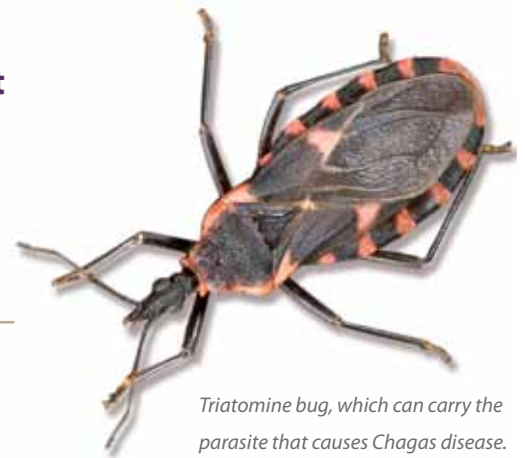
Triatomine bug, which can carry the parasite that causes Chagas disease.

There is still a lot we don't know about these infections...but we know enough to act now.