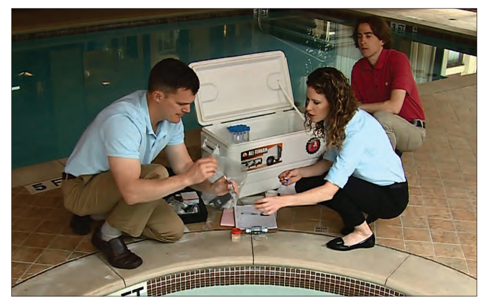
Environmental investigators sample a spa.

To get started, explore CDC's new Legionnaires' disease prevention and outbreak response tools and related resources noted in