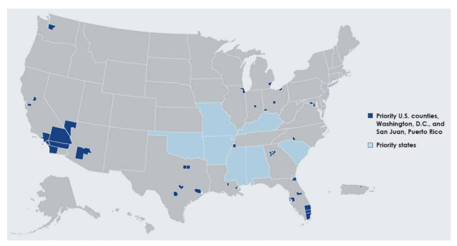
Figure 1. Geographic focus of Phase I of the Ending the HIV Epidemic Initiative focuses on 48 counties, Washington, DC, and San Juan Puerto Rico as well as seven states with a high proportion of HIV diagnoses in rural areas. (Source: https://www.cdc.gov/endhiv/priorities.html)

This program, PS19-1906: Component B: Accelerating State and Local HIV Planning to End the HIV Epidemic, will support jurisdictional planning efforts to end the HIV epidemic in the U.S. These efforts will address emerging and existing needs of targeted jurisdictions through support of planning activities by CDC-funded state and local health departments and their partner organizations and communities. Despite many treatment and prevention advances, reducing HIV infections and improving health outcomes for people with HIV in the U.S. remain challenging. In February 2019, the President announced the Ending the HIV Epidemic in America initiative. The initiative will leverage powerful data, tools, and resources to reduce new HIV infections by 90% over the next 10 years.