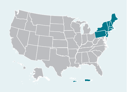
Track A: Clinical HIV Testing and Prevention for Persons with HIV