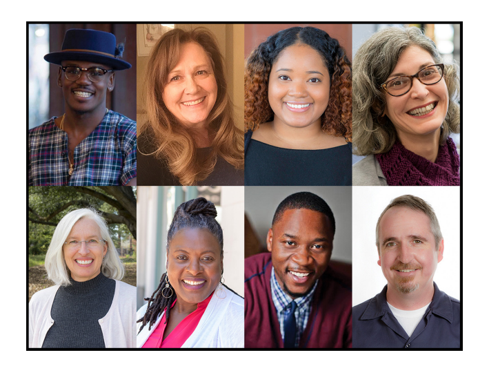
Track A: National HIV E-learning Center