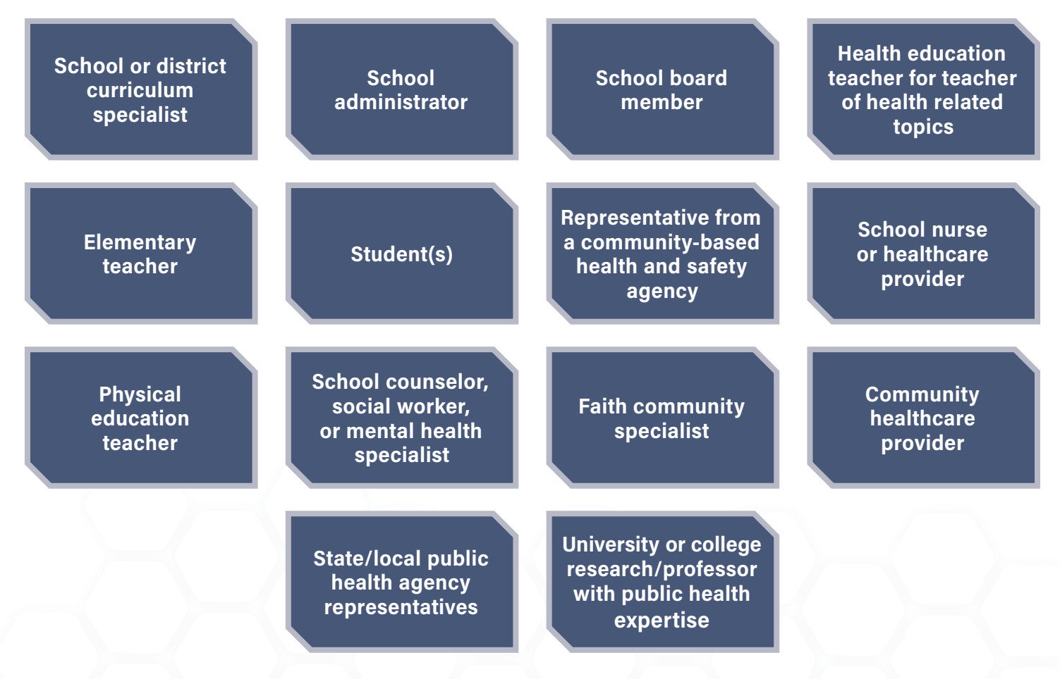
Figure 2. People who might serve on a Health Education Curriculum Review Team

Figure 2 lists the type of people who may be considered as members of a health education curriculum review team.