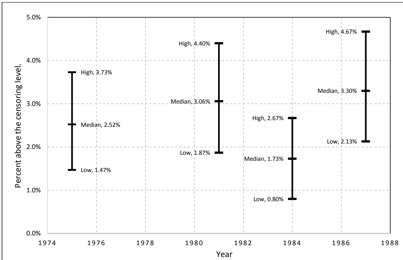
Figure 3-2. Percent of airborne concentration levels above the censoring level. (DuPont 1975a to 1975e, 1981a to 1981f, 1984c to 1984g, 1987b to 1987d).

Based on the statistical confidence intervals themselves and the consistency between them, there is no indication that additional sampling is necessary in order to draw a conclusion from this data. With indications that more than 95% of the air samples SRS collected in thorium work areas were below the censoring level of 1 \times 10^{-12} \mu\text{Ci} alpha/ \text{cm}^3 (2.22 dpm/ \text{m}^3 ), the censoring level is considered to be a bounding estimate of the potential airborne concentration to which a worker might have been exposed.