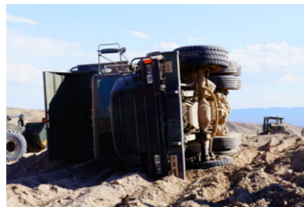
A dump truck tip-over that occurred while operating on a soft surface.