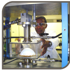
Personal Protective Technology