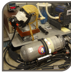
Post Market Assessment