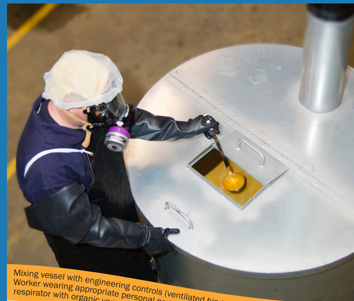
Mixing vessel with engineering controls (ventilated hinged tank lid with access port/lid). Worker wearing appropriate personal protective equipment (air-purifying, full facepiece respirator with organic vapor/P100 cartridges, apron, and gloves).