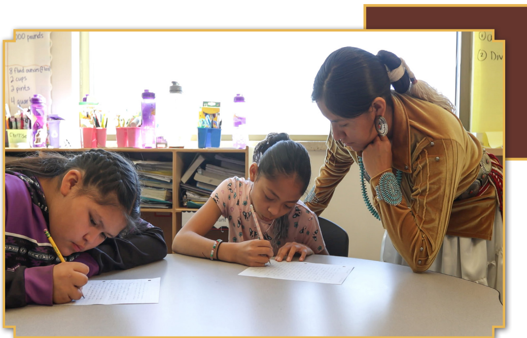
Young Native American teacher with students