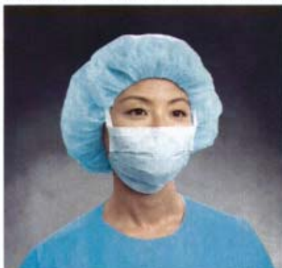
Photo of a Surgical Mask – These masks are not considered to be PPRE by Ontario Health and Safety Practitioners

Surgical masks worn by infected persons may play a role in the prevention of influenza by reducing the amount of infectious material that is released into the environment. If worn to prevent exposure, surgical masks offer a physical barrier to contact with contaminated hands and ballistic trajectory particles. Their biggest limitation is that they do not provide an effective seal to the face, thereby allowing inhalable particles access to the respiratory tract. In addition, the efficiency of the filters of surgical masks in blocking penetration of tracheobronchial or alveolar-sized particles is highly variable and their efficiency in blocking nasopharyngeal-sized particles is unknown.