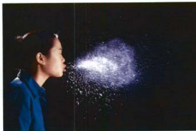
Particle mist created upon sneezing. (Davidhazy, 2007)

There are two primary routes by which influenza virus exits the respiratory tract of an infected person: (i) expulsion of the virus into the air through sneezing, coughing, speaking, breathing or through aerosol-generating medical procedures, or (ii) by direct transfer of respiratory secretions to another person or surface. The new host acquires the virus either by inhalation of the infectious particles from the air or by contact with infectious material directly or via self-inoculation through a contaminated hand.