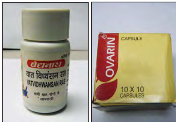
FIGURE. Two of 10 Ayurvedic medications associated with lead poisoning in six pregnant women — New York City Department of Health and Mental Hygiene, 2011–2012